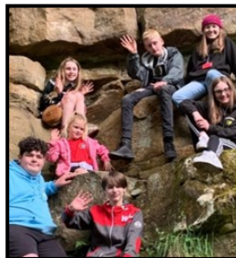
Woodies at Causey Arch in May