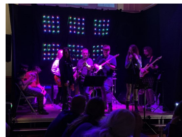
Sound Hub Summer Showcase

Our music project funded by Ronnie Scott Charitable Foundation and County Durham Community Foundation continues to offer low cost guitar and drumming tuition every Saturday. In July our budding Sound Hub musicians held a showcase event for parents, relatives and friends. They were supported by the Sound Hub tutors who formed their own band for the night, namely The Tutons. This was a brilliant event with over 100 people in attendance and the young people raised over £400 for their project.