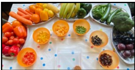
Fun and Food in February 2022

The task force is an exciting project that was halted due to covid-19. We have a dedicated team of young volunteers, aged 13+. Returning after lockdown 2.0, the young volunteers are enthused and keen to progress and other young members are now old enough to volunteer and keen to do so. They have just submitted their first funding bid to the Happy and Healthy Fund through NE Youth – fingers crossed they get it!